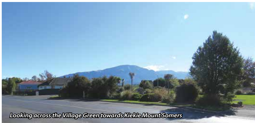
Looking across the Village Green towards Kiekie Mount Somers

There was a time when I was extremely unwell, and nearly lost my life. On my return from hospital, neighbours and members of the Mount Somers and Staveley communities popped in every day with meals and baking. I did not cook