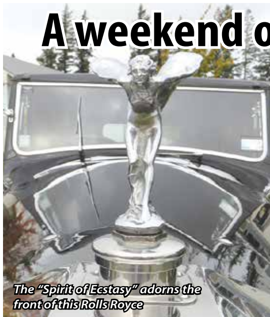
The "Spirit of Ecstasy" adorns the front of this Rolls Royce