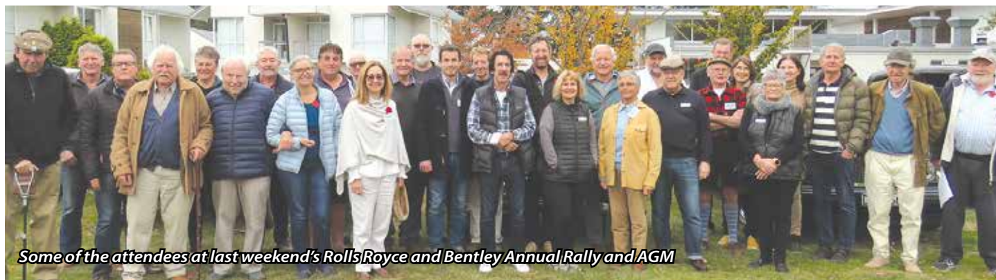
Some of the attendees at last weekend's Rolls Royce and Bentley Annual Rally and AGM

all arrive on large vehicle trailers or on the back of trucks."