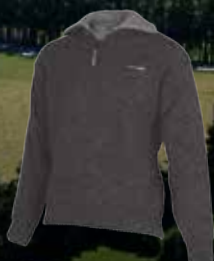
MKM TASMAN JERSEY $168.20