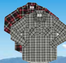
SWANNNDRI KIDS EGMONT SHIRTS TWIN PACK $48.80