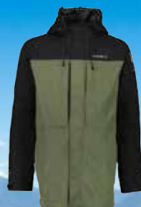
LINE7 MEN'S TERRITORY STORM PRO 20 JACKET $438.40