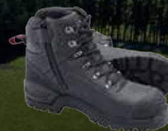
JOHN BULL CROW WORK BOOTS $218.00

*T&C'S APPLY. PRICING VALID UNTIL 31 JULY 2022 UNLESS OTHERWISE STATED OR WHILST STOCKS LAST. PRICES ARE GST INCLUSIVE.