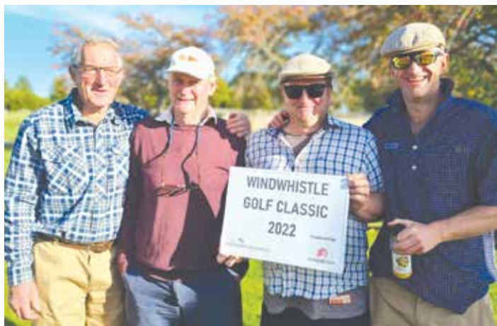
Local team "Longspur" at the Windwhistle Golf Classic.

The organising committee and Windwhistle School wish to say a huge thank you to the many sponsors listed in the advertisement in this