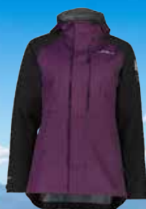
LINE7 WOMEN'S TERRITORY STORM PRO 20 JACKET $438.40