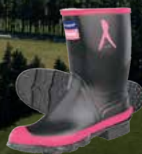
WOMEN'S PINK BAND GUMBOOTS $78.50