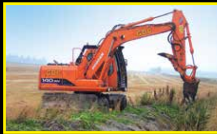
16 ton Wheel Digger - General Farm Maintenance. Mulching, Race Cleaning