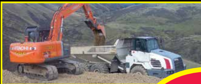
Land Prep and Dairy Conversions