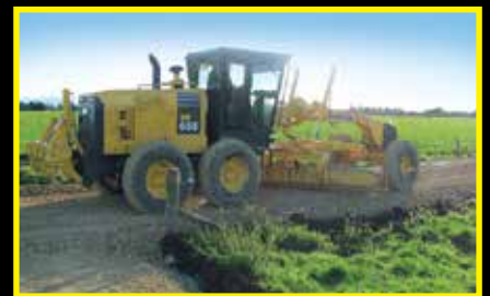
Road Construction and Lime Capping