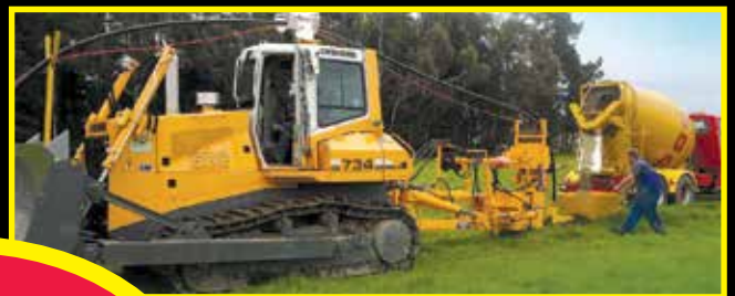
Power, Cable, Fibre and Water installation