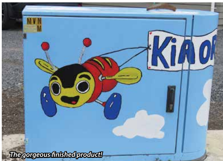
The gorgeous finished product!

If you would like Chloe and Dion to come and paint something for you on commission, you can contact Chloe: 027 374 4585.