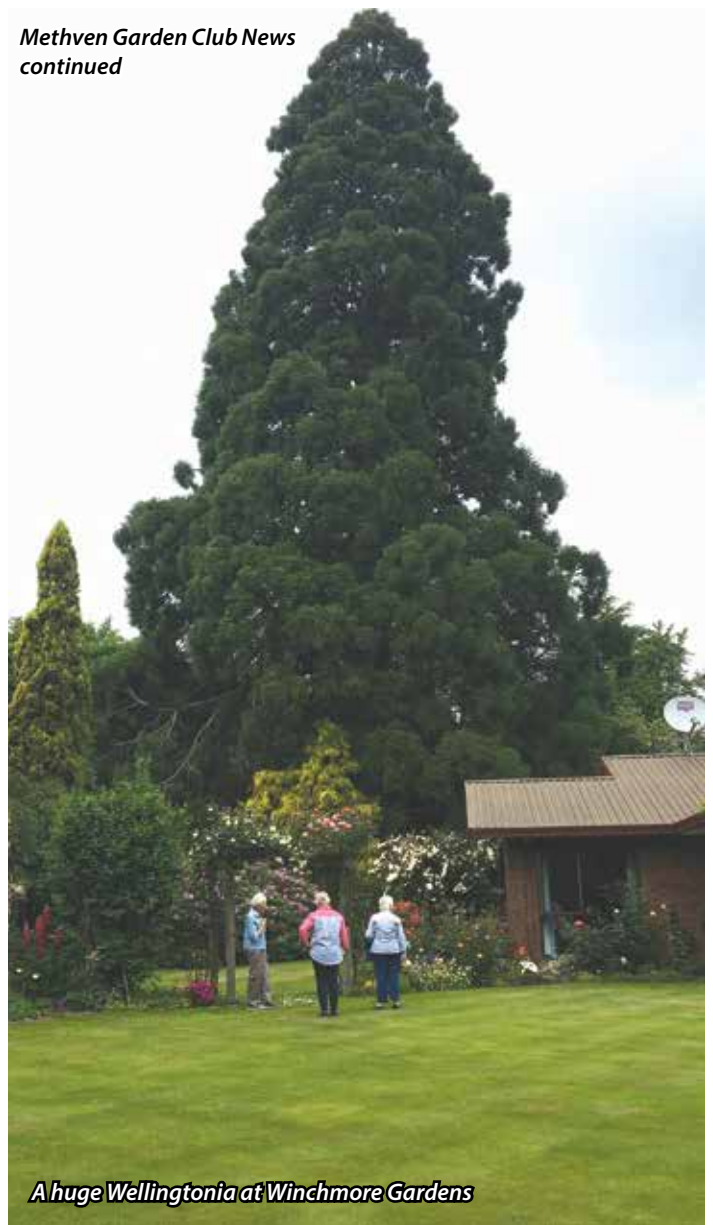
A huge Wellingtonia at Winchmore Gardens

Their children and grandchildren now run the farm. The garden is extensive, encompassing twelve hectares developed over many years. The display of towering mature trees, rhododendrons, camellias, roses and many perennials are a sight to behold. We sat and ate our packed lunches overlooking one of three large ponds - just magnificent and very tranquil. The garden boasts a six hole golf course. A whole day could have been spent taking it all in. Dianna spends 12 hours per day, sometimes more, maintaining her garden. She said it takes her 16 hours to mow the lawn on a ride-on mower. Two huge vegetable gardens feed all the family and more. They were looking very healthy so early in the season. An archway of old and newer apple varieties were laden with young fruit - surely a labour of love!