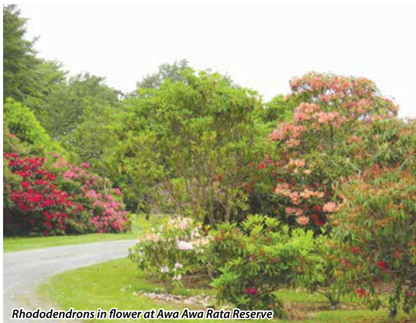
Rhododendrons in flower at Awa Awa Rata Reserve

The Awa Awa Rata Reserve Society held its AGM last week. Members of the committee help maintain the rhododendron plantings at the reserve and there is also a focus on protecting the native plants and animals.