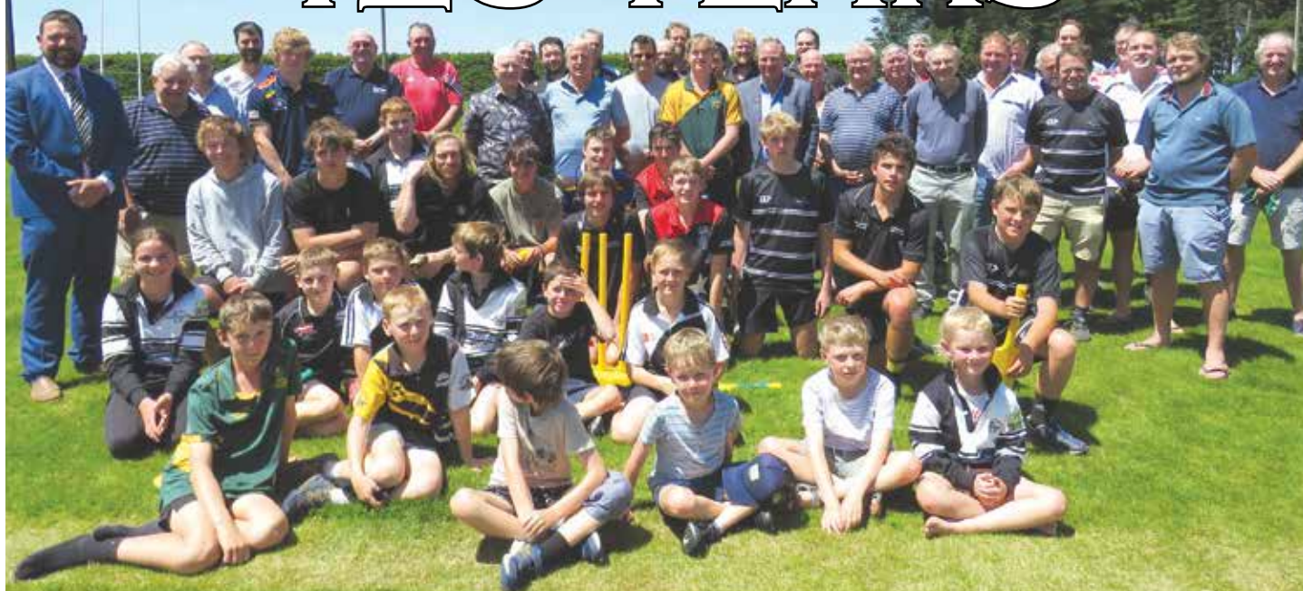
Past and present members of Methven Cricket Club gathered for a weekend of celebration of the game

Methven Cricket Club celebrated 125 years of playing the time honoured game at the weekend.