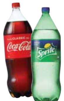
Coke/Sprite/ Fanta/Lift/L&P 2.25L