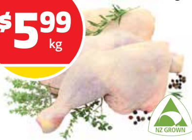
Fresh NZ Whole Chicken Legs