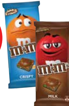
M&M's Chocolate Block 150-160g