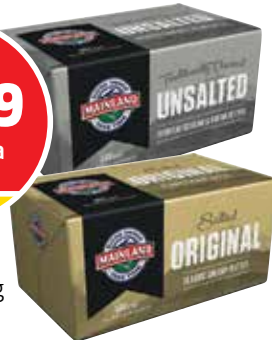
Mainland Butter 500g