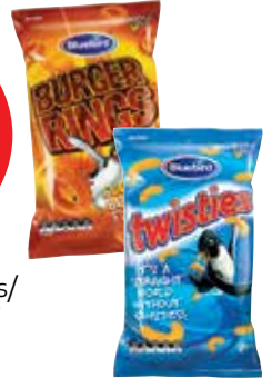
Bluebird Burger Rings/ Twisties/Cheezeels/ Rashuns 110-120g