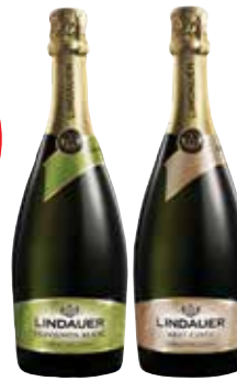
Lindauer 750ml (Excludes Special Reserve/ Vintage Series)