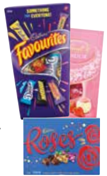
Cadbury Roses 225g/ Favourites 265g/ Lindt Lindor Bag 125g