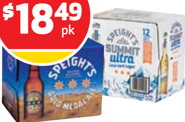
Speight's Gold Medal Ale/ Summit Ultra 12 x 330ml Bottles