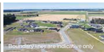
Boundary lines are indicative only