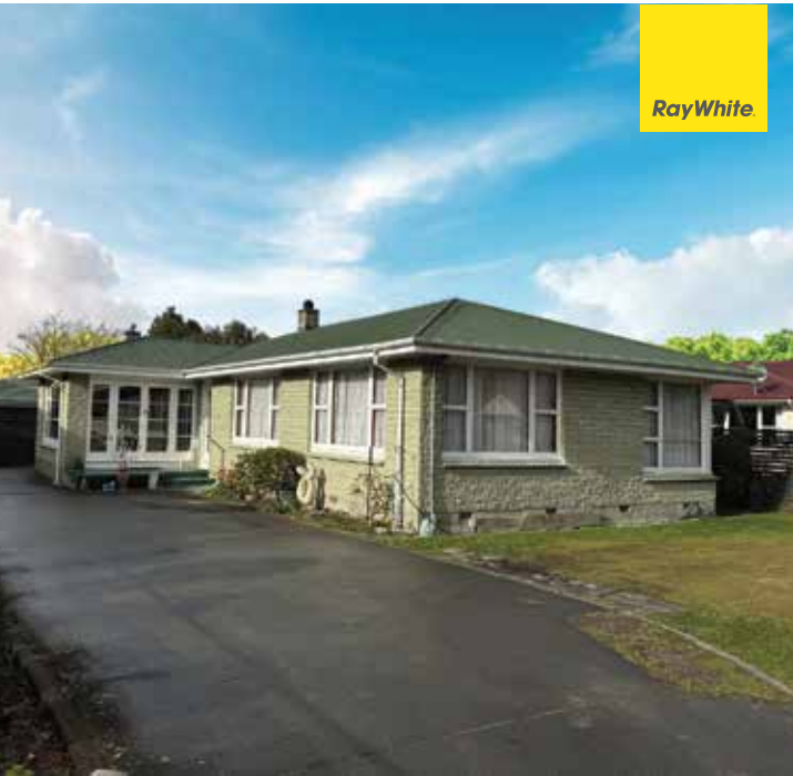
58 Main Street, Methven

rwashburton.co.nz/MVN30092 Real Estate Mid Canterbury Property Ltd Licensed (REAA 2008)