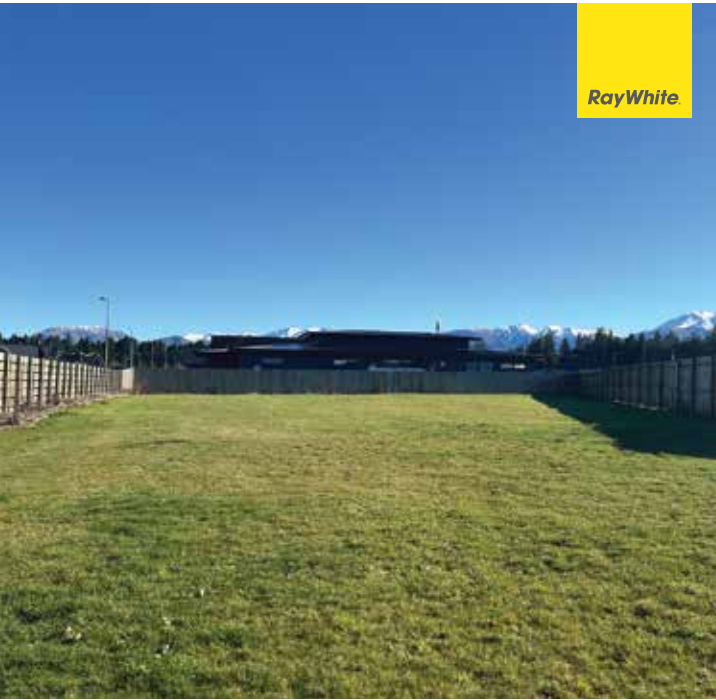
1 Arrowsmith Drive, Methven

rwashburton.co.nz/MVN30103 Real Estate Mid Canterbury Property Ltd Licensed (REAA 2008)