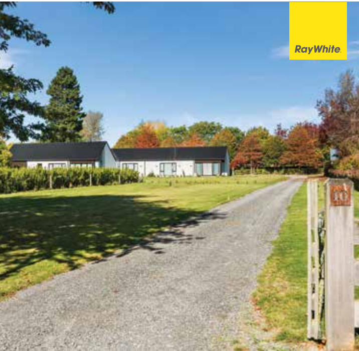
10 Dolma Street, Methven