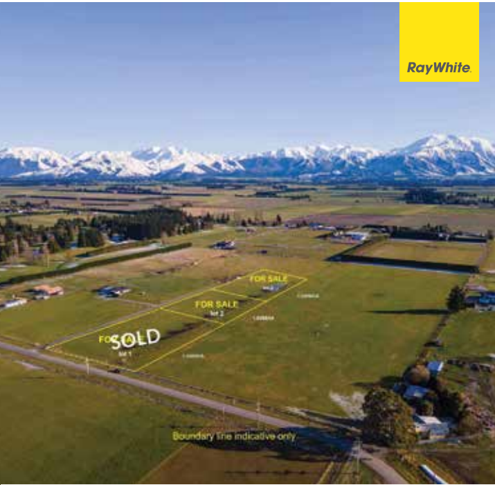
Lots 2 & 3 Hobbs Road, Methven

rwashburton.co.nz/MVN30102 Real Estate Mid Canterbury Property Ltd Licensed (REAA 2008)