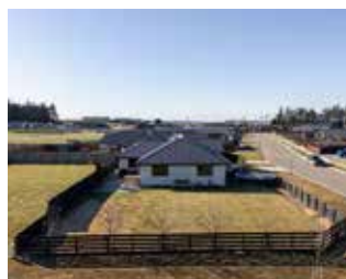
» 1 Gleniffer Place, Methven