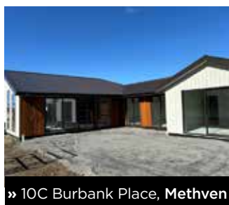
» 10C Burbank Place, Methven