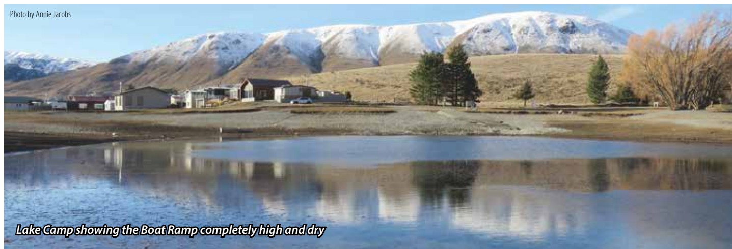
Lake Camp showing the Boat Ramp completely high and dry

flows at the State Highway 1 bridge, and that creates a lot of uncertainty. "Councillors had a robust debate about our responsibilities and how much money it might cost and, in the end, voted not to progress any consent."