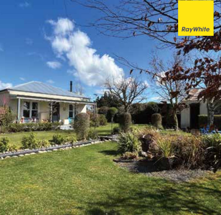
9 Mckendrys Road, Lyndhurst, Ashburton

rwashburton.co.nz/MVN30103 Real Estate Mid Canterbury Property Ltd Licensed (REAA 2008)