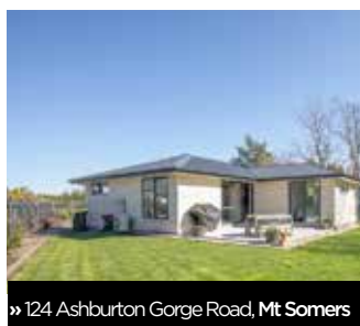
» 124 Ashburton Gorge Road, Mt Somers

Deadline Sale: 1 October 2024 Reference: RX4259690 Open Home: Saturday 28 Sept 1:30pm-2:00pm