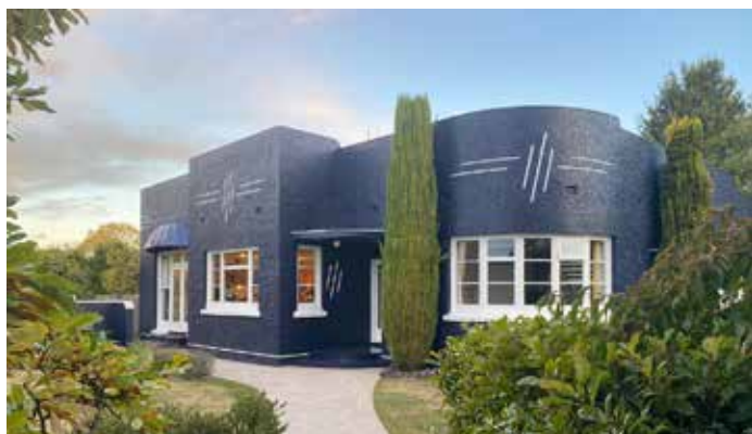
» 17 Spaxton Street, Methven