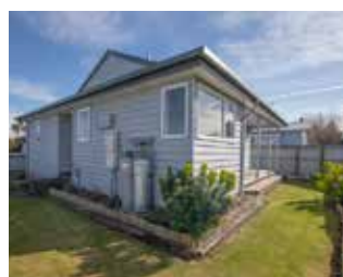
» 53 Morgan Street, Methven