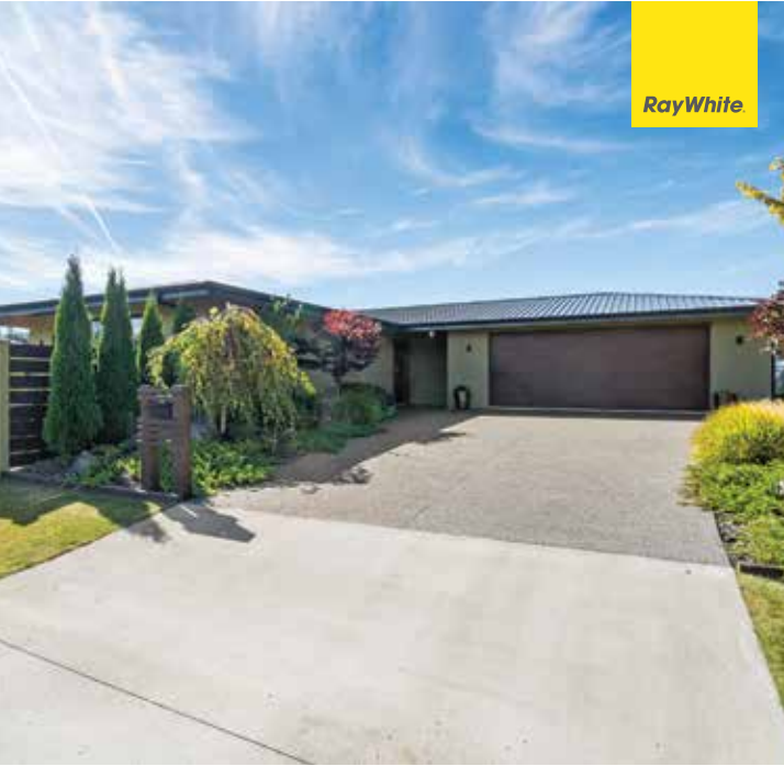
4 Memorial Crescent, Methven

rwashburton.co.nz/MVN30107 Real Estate Mid Canterbury Property Ltd Licensed (REAA 2008)