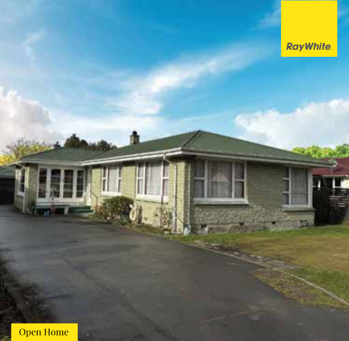
58 Main Street, Methven