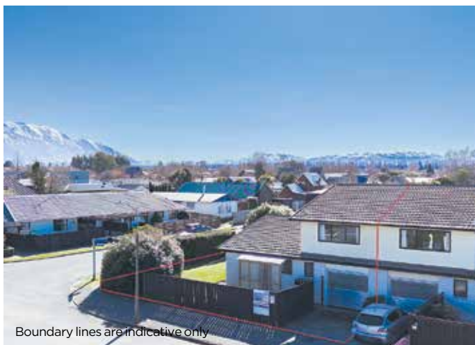
Boundary lines are indicative only