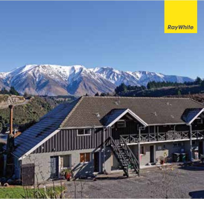
46 Zig Zag Road, Windwhistle

rwashburton.co.nz/MVN30093 Real Estate Mid Canterbury Property Ltd Licensed (REAA 2008)