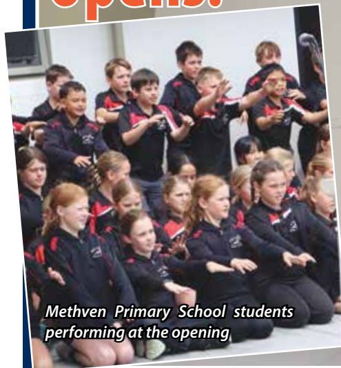
Methven Primary School students performing at the opening

Dedication, hard work and unwavering belief that it was the right thing to do, saw Methven Central Care Home open on Monday, 8th December.