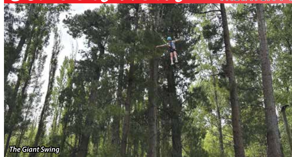
The Giant Swing