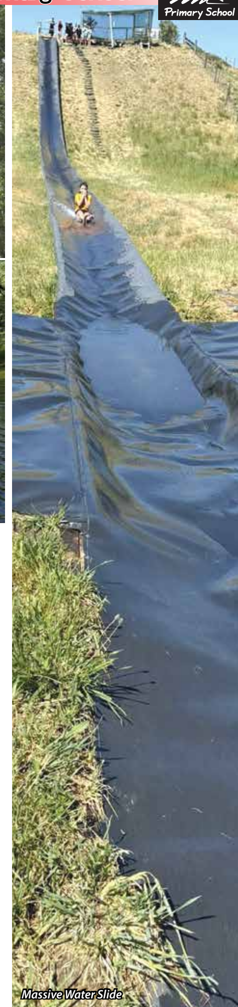
Massive Water Slide