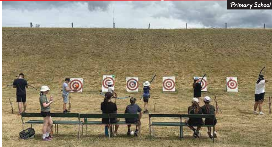
Archery at Waipara Camp