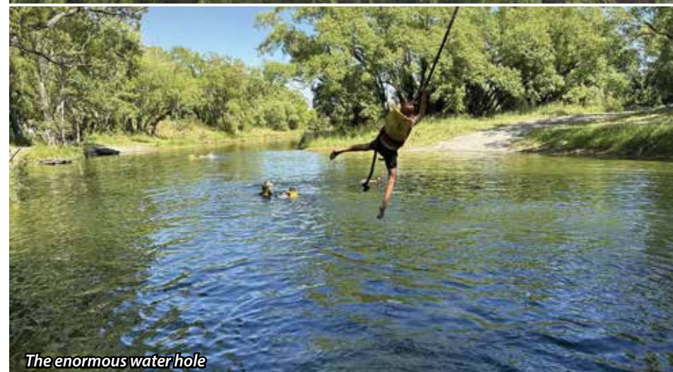
The enormous water hole